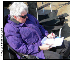
Keeping up with the count!

date because it was not too long after that, raptors began flooding into the valley. Within a six-day period nearly 10,000 raptors passed by the count area. One of those days was over the top with